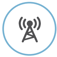
Smart Base Station