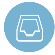
As solid as a rock