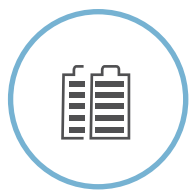
Dual Batteries Dual insurance